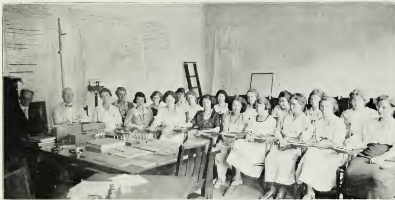
THE FIRST CLASS IN SPECIAL EDUCATION

In 1921 there was established at the Teachers College of Miami University a Department for the Training of Teachers of Defective Children—subnormal and delinquent. Teachers who prepare themselves for this type of teaching receive higher remuneration. Many superintendents are establishing classes of such children in the systems under their charge. If you are interested in this type of teaching, send for Special Bulletin, Bureau of Special Education.